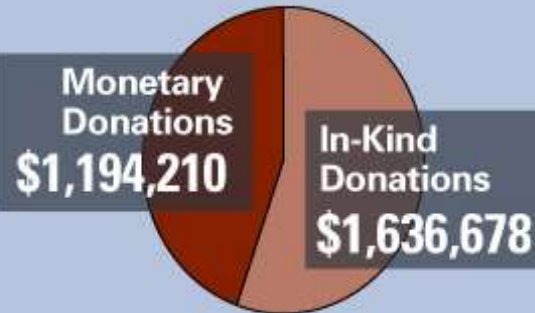
Source of Financial Donations (represents 4,400 gifts ranging from $5 to $100,000)